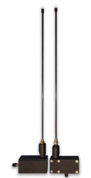
Dual-Band Low-Profile Antenna