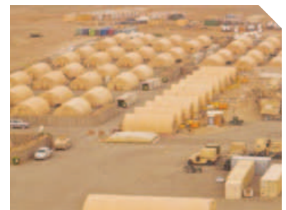
Comms into Urban Canyons