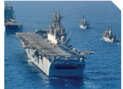
Comms from Shore-to-Ship