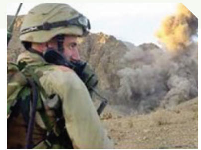
Comms over Terrain