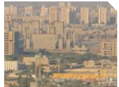
Comms into Urban Canyons